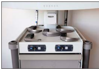
Brackets for C-HUB II

Part Number: XUSM0011 Description: PlatinumPlus Cart for Video Intubation Platform Dimensions: 18.9" (H) × 20.6" (W) × 59.9" (D) Weight: 127 lbs.