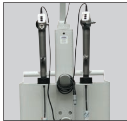
Two Scope Holders