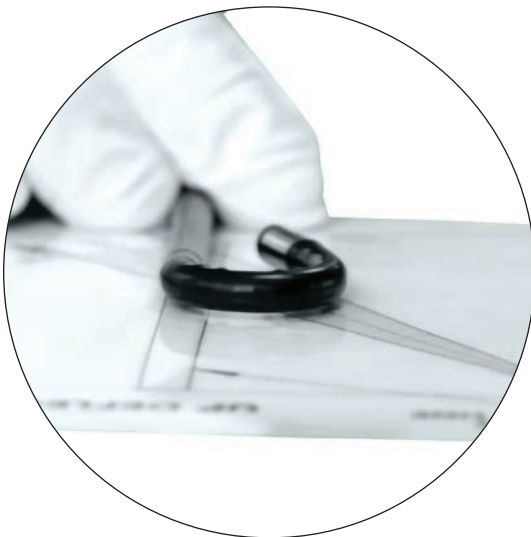
Robust Articulation Cover

The large 7 Fr working channel and distal articulation cover have been fortified to resist scrapes and punctures, allowing for easy insertion of instruments such as biopsy forceps or cauterization electrodes.