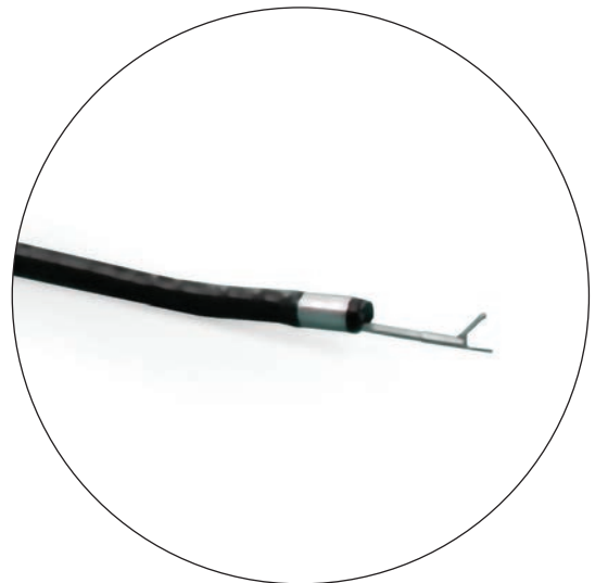
Fortified Working Channel