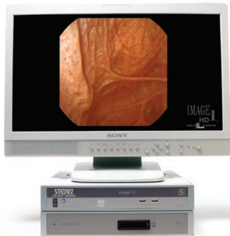
HD-VIEW™ with IMAGE1 S™ CHROMA enabled