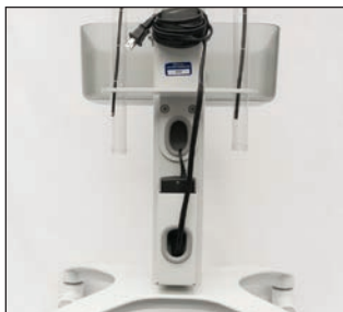
Power Supply Storage