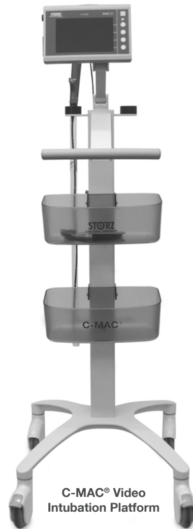
C-MAC® Video Intubation Platform