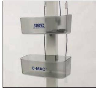
Two Storage Bins