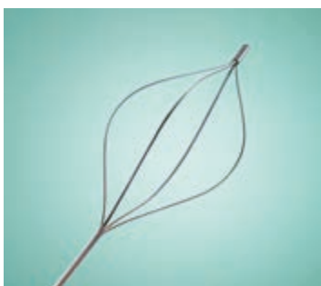
Straight with tip