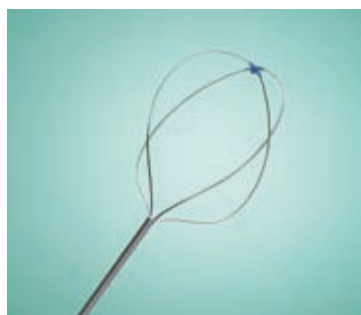
Straight without tip