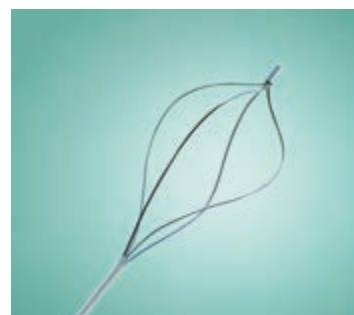
Helical with tip