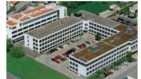
KARL STORZ Production/R&D