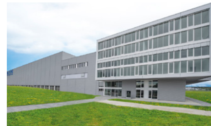
KARL STORZ Logistics Center