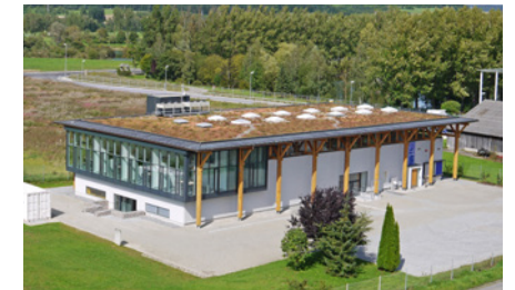
KARL STORZ Visitor Center