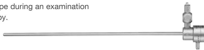
64018US Examination and Protection Sheath , diameter 3.5 mm, working length 17 cm, for HOPKINS® Telescope 64029BA

Protects the telescope during an examination or during laparoscopy.