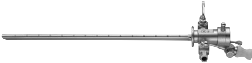
67065CK Operating Sheath , 14.5 Fr., working length 15 cm, with working channel 5 Fr. and two stopcocks, including blunt Obturator 67065CO

Protects the telescope and allows for insertion of an instrument. The two stopcocks allow simultaneous inflow and outflow of fluid or gas. This is especially useful during cystoscopy, rhinoscopy, vaginoscopy and otoscopy.