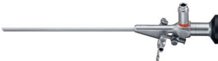
67031BA Integrated Multi-Purpose Rigid Telescope 30° , HOPKINS® telescope, 11.5 Fr., with working channel 5 Fr., working length 14,5 cm, autoclavable , fiber optic light transmission incorporated, including Sealing Cap 27550C, color code: red

With an integrated 5 Fr. channel and an outer diameter of only 11.5 Fr., the IMPR fits into tight spaces, making it ideal for endourology and a variety of ENT procedures.