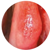
Standard Format Telescope