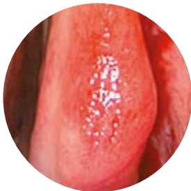
Large Format Telescope